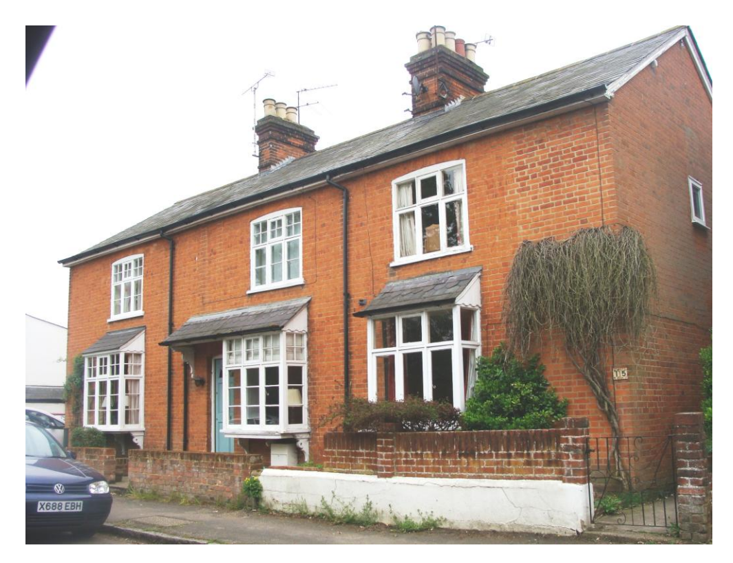
Picture 5 - Nos. 11-15 Buntingford Road, late 19/early 20<sup>th</sup> century, non listed properties of quality.

with slate roofs and 2 no. prominent chimney stacks. 3 no. bay windows to front with slate canopies above and some decorative wooden detailing and supporting brackets. . An Article 4 Direction to provide protection for selected features, including chimneys, may be appropriate subject to further consideration and notification.