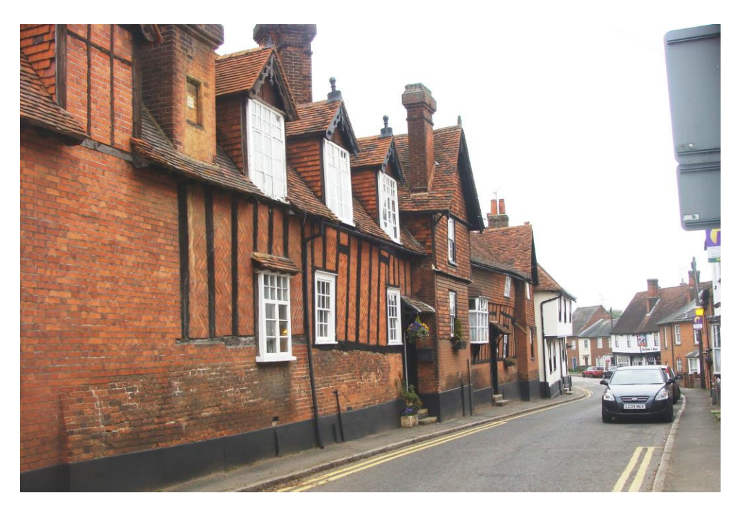
Picture 3 – 54-60 High Street, 16<sup>th</sup> century or earlier, re-fronted in 19<sup>th</sup> century.

been re- fronted and Gothicised in the late 19<sup>th</sup> century. The frame is exposed with 19<sup>th</sup> century herringbone brick infill; it has a steeply sloping old red tiled roof and tall brick chimneys rebuilt in 1900. The Listed Building description accurately describes it as a 'long picturesque irregular building stepping up a hill...'