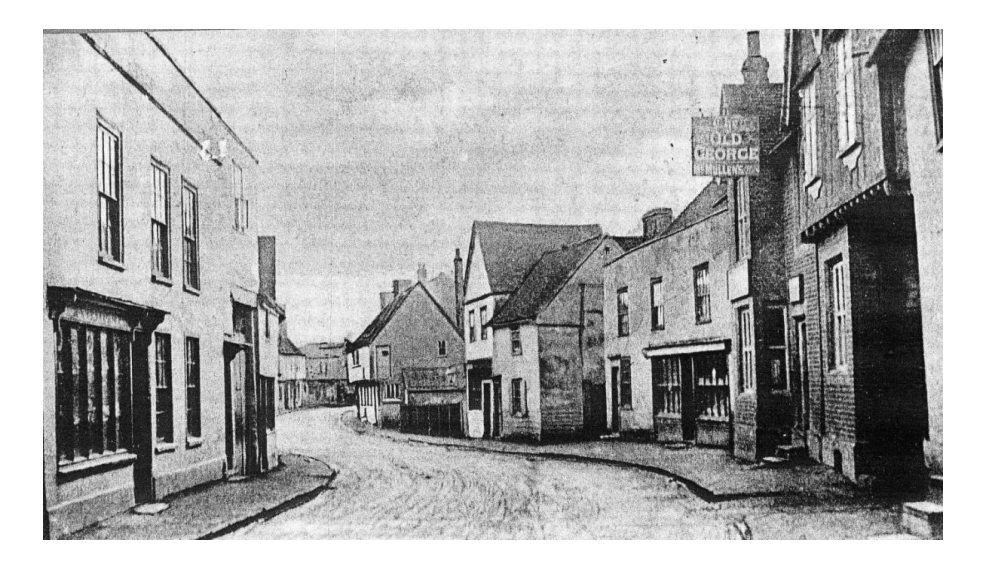
Picture 1 - High Street, early 20<sup>th</sup> century.

3.7. Little had changed by 1897 although the map of that date identifies the presence of a brewery on land between High Street and Tollsworth Road.